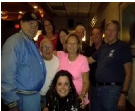
Halloween Party, Apple Dumplings, a couple birthday parties